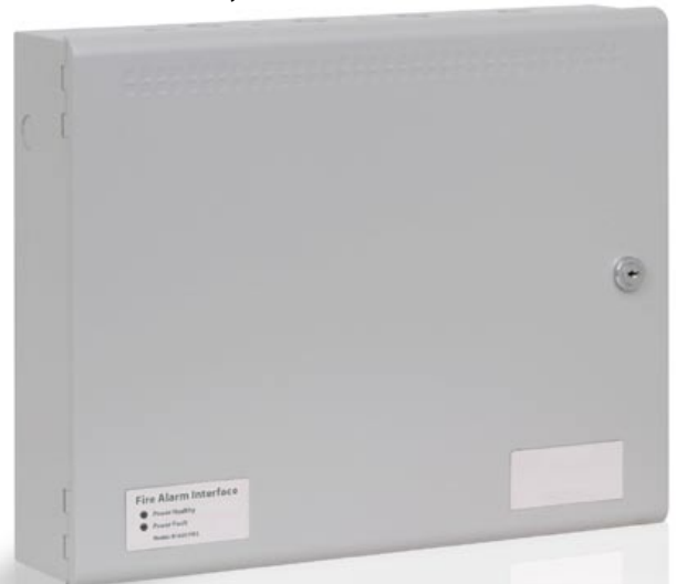
Model No. K16001M2