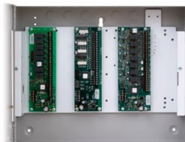
3x I/O boards without PSU