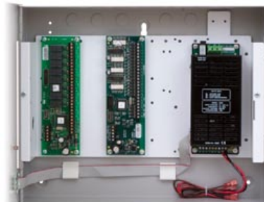
2x I/O boards with PSU