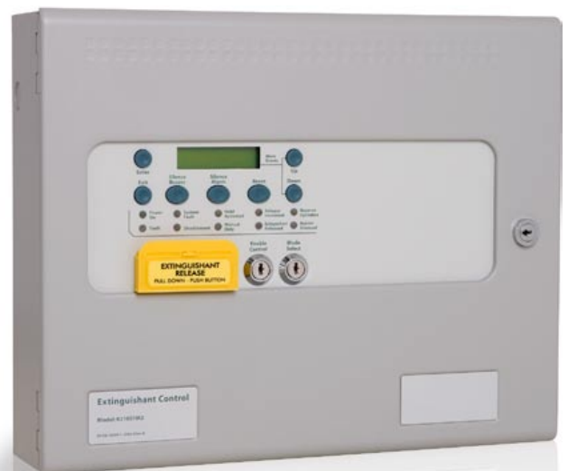
Model No. K21001M2