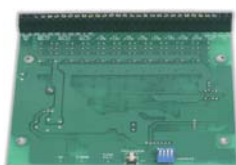
Ancillary PCB Part No. K580