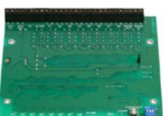
Sounder PCB Part No. K461