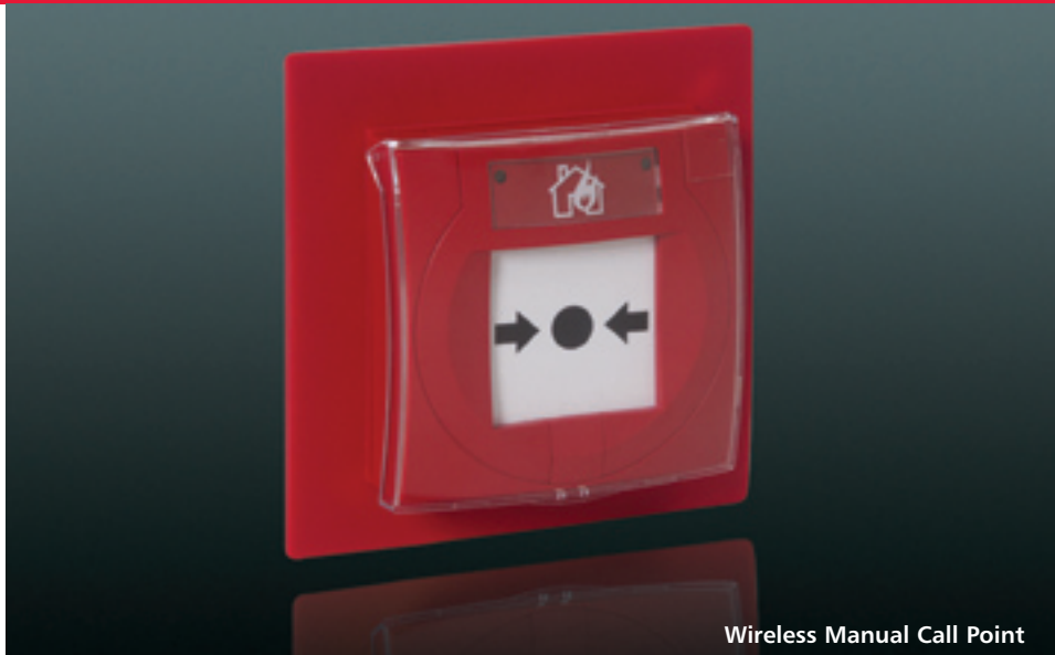
Wireless Manual Call Point

The Gent hybrid wireless system connects to the wireless transceiver via a wireless base. The wireless base can be fitted with either a red or white interface plate.