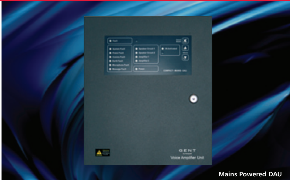
Mains Powered DAU